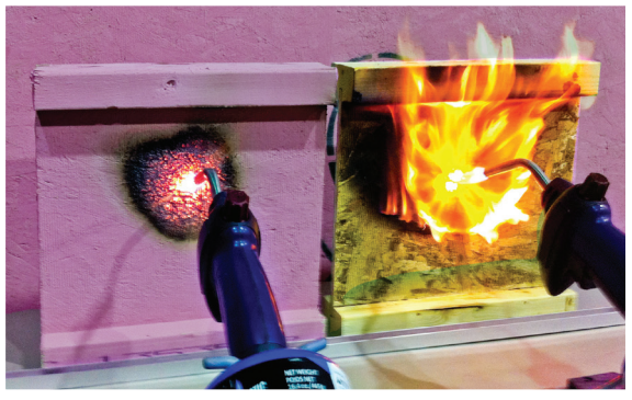
Actual Burn Through Test: PinkShield coated I-joint vs. uncoated I-joint

PinkShield™ is a FIRE RESISTANT intumescent paint that is designed to increase the time of ignition and slow the spread of flame should a fire occur.